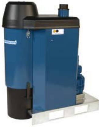
Stationary High Vacuum Unit L-PAK. Robust and durable compact design for any factory or workshop.